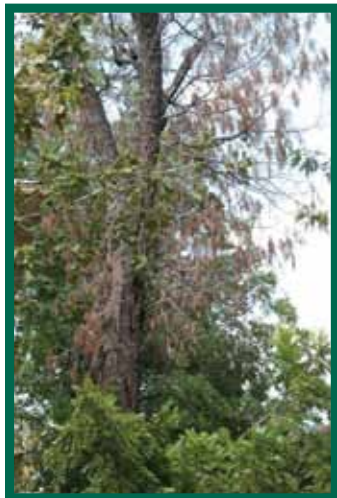
A black walnut showing flagging, a symptom of TCD.

Thousand cankers disease (TCD) is a new and lethal disease of walnuts in Colorado. It is caused by a fungus that is carried from tree to tree by the very small walnut twig beetle. Once the fungus is introduced into the tree, it