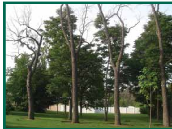
Walnut trees killed by TCD in the Denver area.