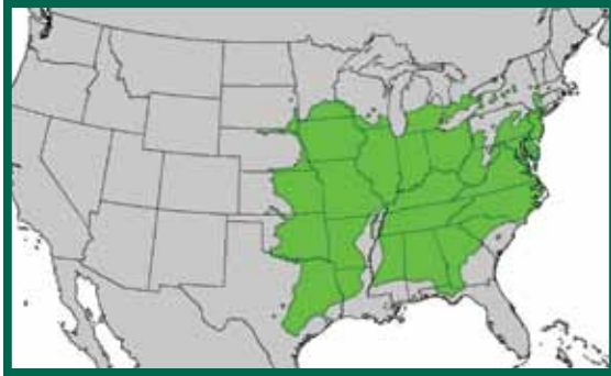
Native range of black walnut in the United States.