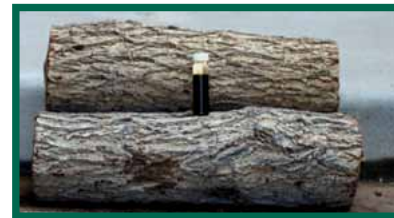
More than 23,000 adult walnut twig beetles (brown sediment in vial) emerged from these two logs.

Trees killed by TCD support development of large numbers of walnut twig beetles. Moving a single log with live beetles inside can start an outbreak in a new location.