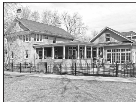
Denver's largest surviving elm tree resides on this property.